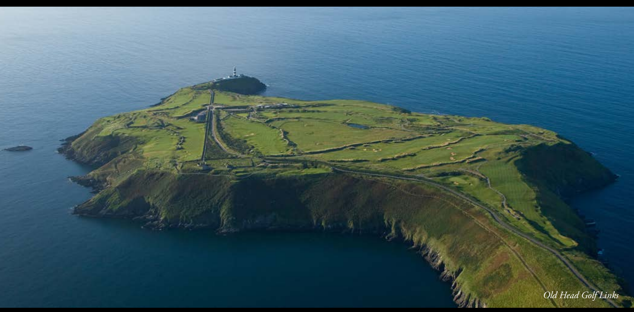
The Southwest of Ireland August 2020